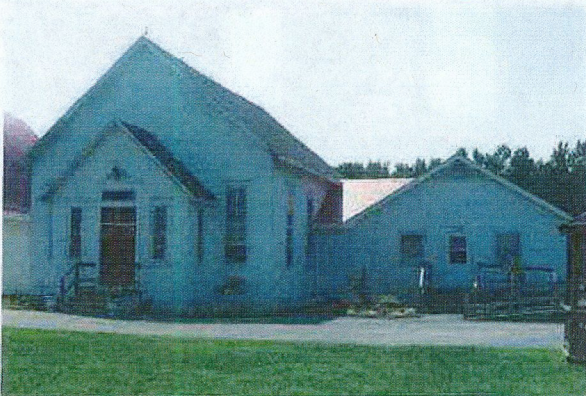
1890 Epworth Church

The Museum is owned and operated by the Georgetown Historical Society.