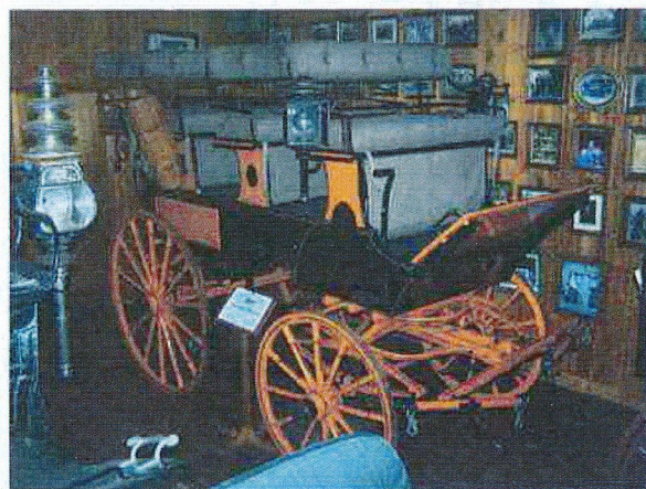
Walt Disney Carriage

We also can be reached at: marvelmuseum@gmail.com