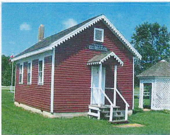
Ellis Grove School